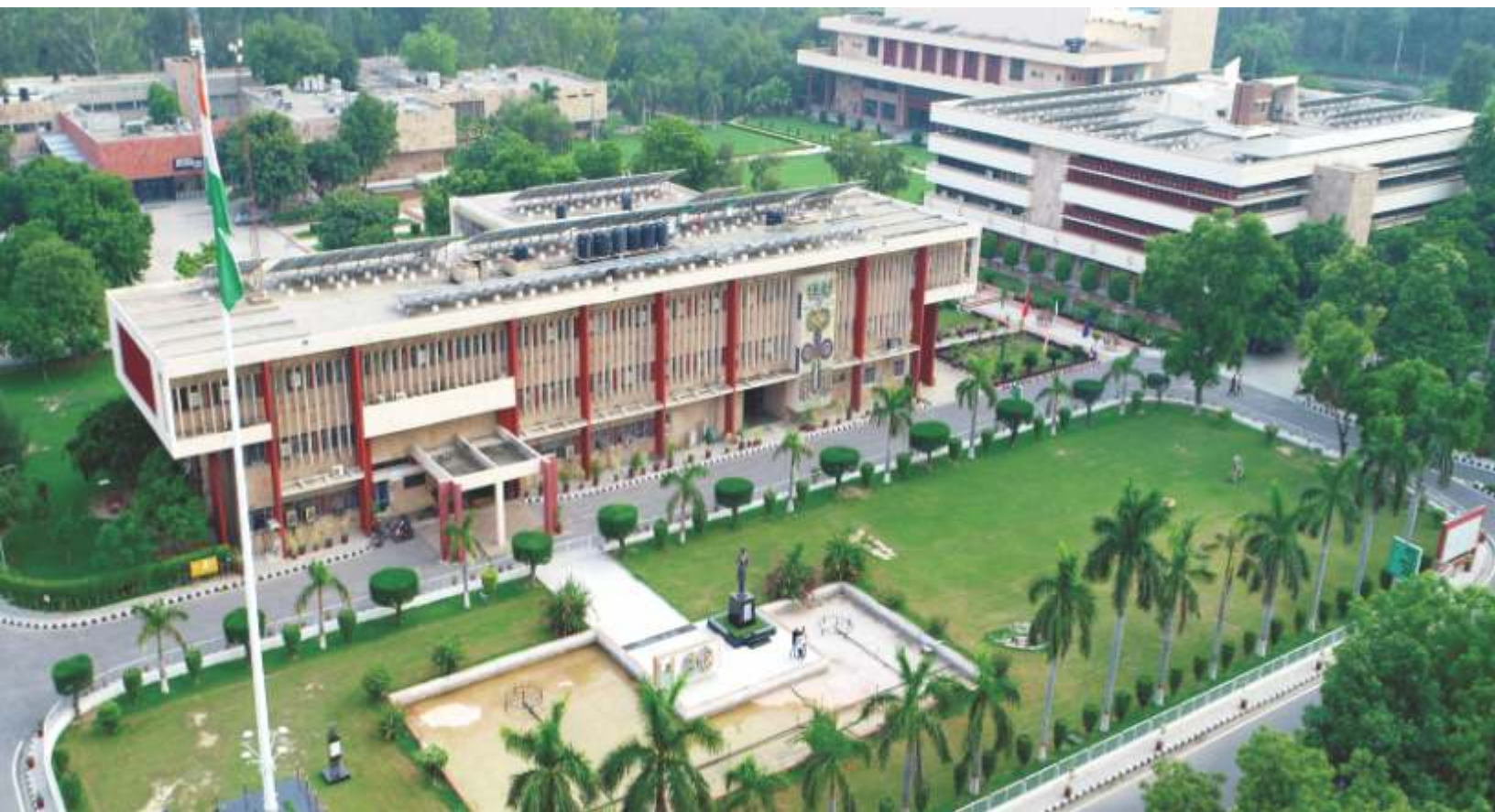
Aerial view of Fletcher Bhawan of CCSHAU Hisar

The main campus of the University is situated at Hisar at a distance of about 162 km North-West of Delhi of National Highway No. 9 and is 2.5 km from the Hisar Railway Station and 3 km from the Bus Stand. The University is spread over an area of 2922 hectares and 645 hectares at outstations. Area under farms at Hisar is 2624 hectares and under buildings and roads is 298 hectares. Since its existence, the University has been making rapid progress in building construction and has an excellent infrastructure. The University has one of the best developed campuses in India and fulfils academic and extra-curricular needs of the students.