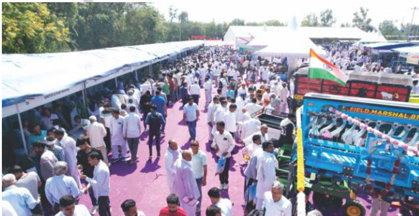
An aerial view of the grand Krishi Mela held near Gate No. 3. Farmers, students, and visitors engaged in large numbers.

Any provisions or guidelines provided in the Prospectus are not final and are subject to modifications made by the Competent Authority under the Act & Statutes and if superseded by such decision by the Competent Authority, the latter will prevail and the information given in the Prospectus shall stand modified to that extent automatically.