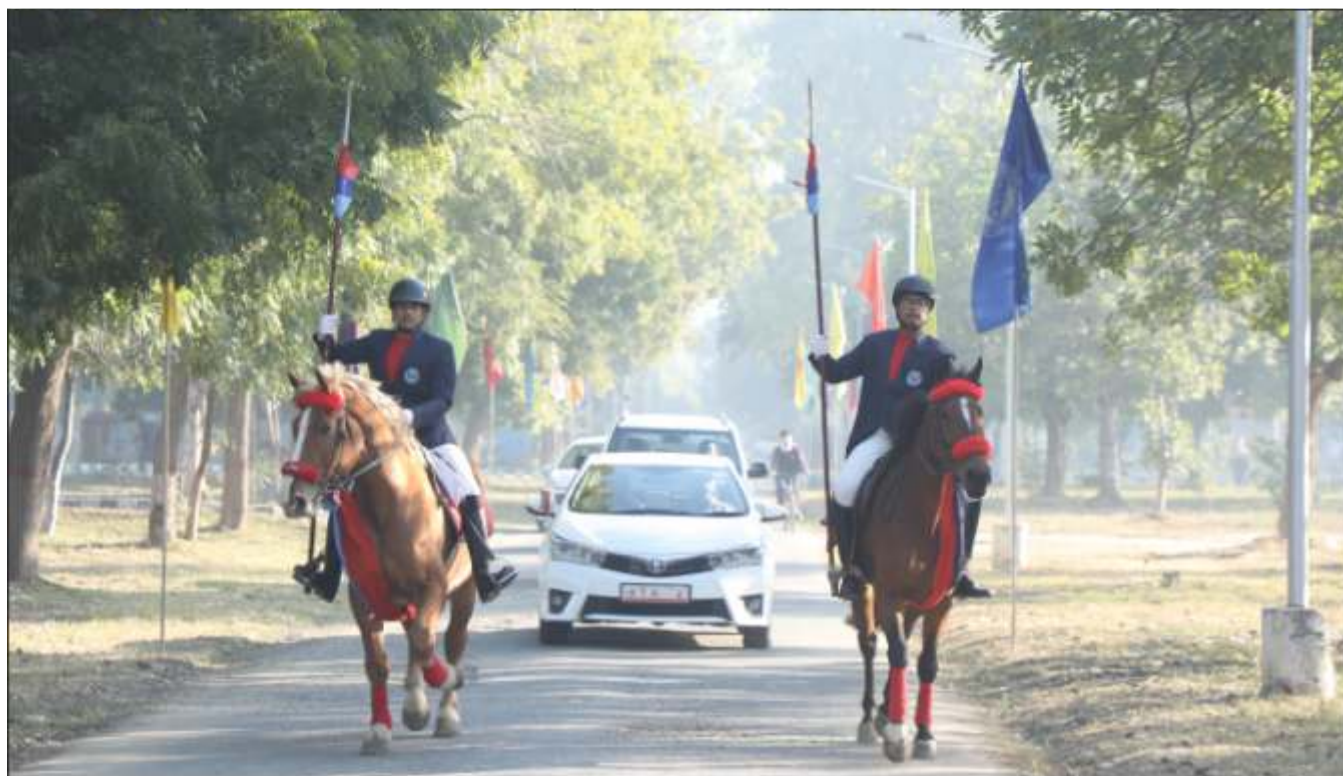
NCC Cadets Escorting Worthy Vice Chancellor for Republic Day Parade