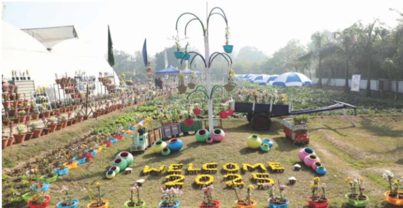
The Flower Show at Agritourism Centre featured vibrant arrangements and a cheerful welcome. The "Welcome 2025" floral design set a festive tone.

* If the PWD candidates exceeds 3% then extra seats upto 2% more will be created.