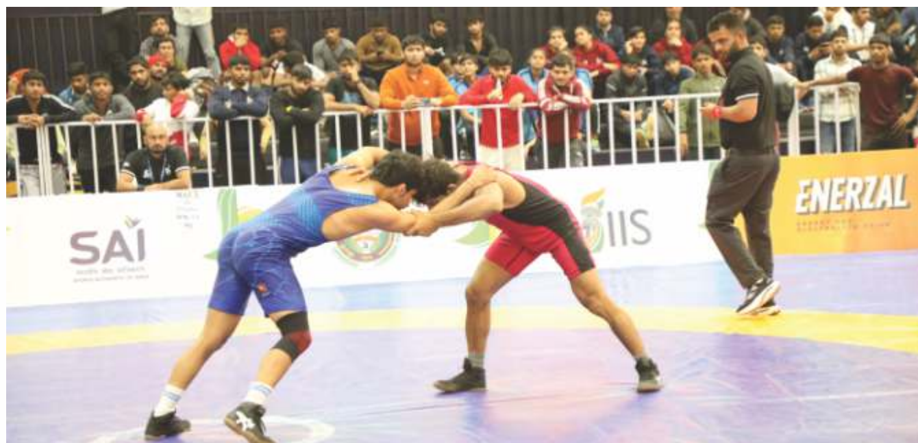
A wrestling match energized the campus at Giri Centre, CCSHAU Hisar. Organized with SAI, it featured spirited athlete participation.