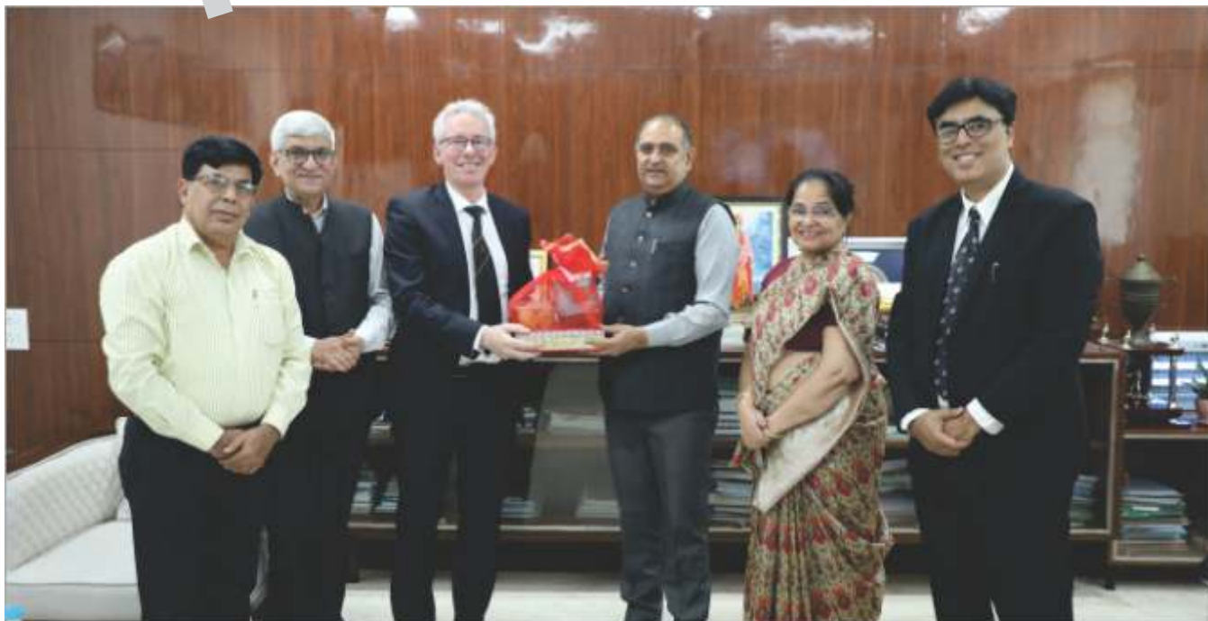
The esteemed Vice Chancellor of CCS HAU bestows recognition upon a scientist from Massey University, New Zealand, during his visit for extension of MoU

Jurisdiction for all disputes shall be at Hisar.