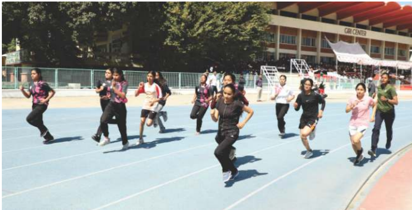
CCShau students showcased athletic spirit on the synthetic track at Giri Centre. The event drew cheers, reflecting skill and competitive zeal.