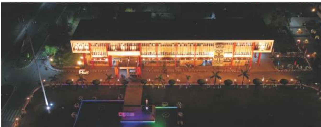
Radiant Nights The Administrative Block of CCSHAU shines bright, guiding the way for academic excellence.

The Prospectus gives only general information about the various Constituent Colleges and programmes offered. Detailed rules on all aspects are available in the University Calendar Vol. II and instructions issued from time to time.